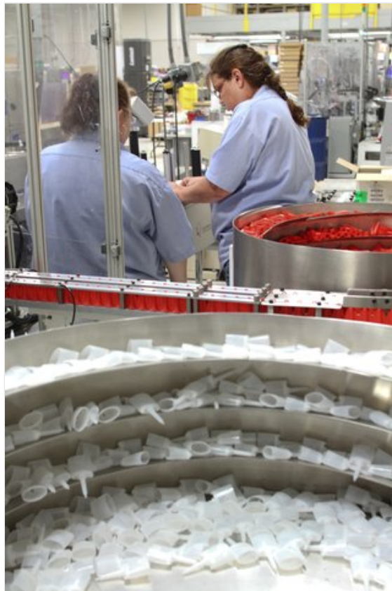
Applicator tips and caps circle around to line up for assembly with bottles at the Krazy Glue plant in West Jefferson, where manufacturer Toagosei America is plotting a new facility.